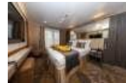
Deluxe Veranda Forward Stateroom