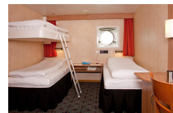
Cat 2 - Twin